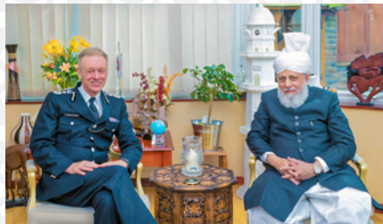
Bernard Hogan-Howe meeting his Holiness