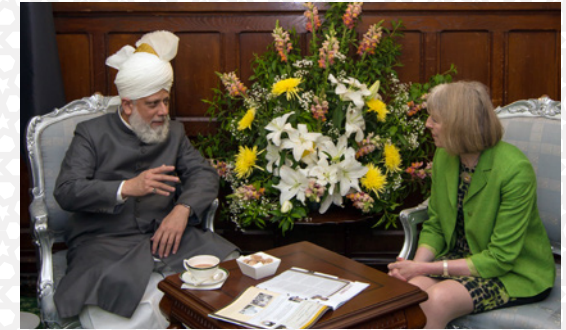
Theresa May meeting his Holiness