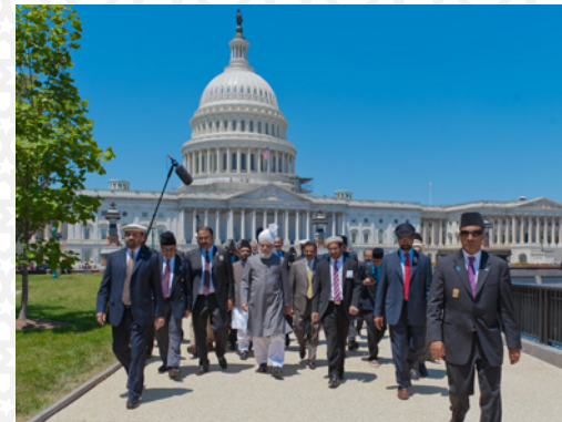
His Holiness at Capitol Hill after his historic address to US Statesmen and Bureaucrats, Washington D.C, USA