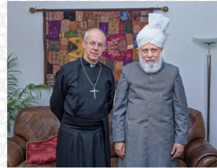
The Archbishop of Canterbury meeting his Holiness