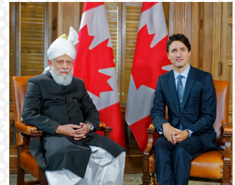
Justin Trudeau meeting his Holiness